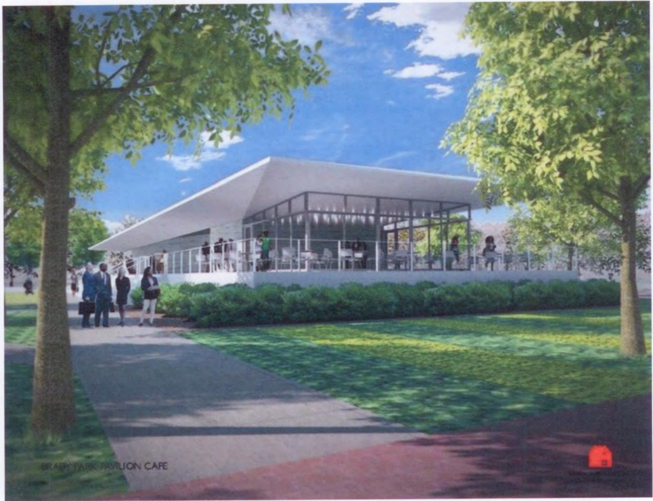
A rendering shows the Pavilion Cafe proposed for the Guthrie Green, now under construction in the Brady Arts District. Courtesy

Copyright © 2012, World Publishing Co. All rights reserved